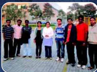
Team 'Buy-Cycle' at HICC for the Republic day ride