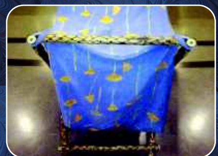
Sacks designed by students for the 'Kachara Daan' program in the bamboo frame