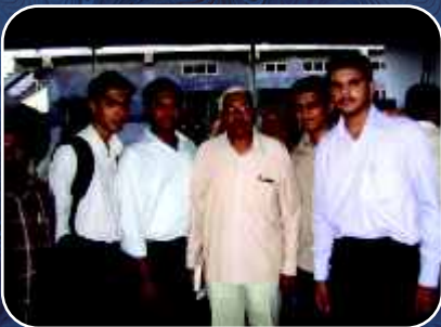
ABS students with JAC leader Prof. Kodandaram at Kisan Swaraj Yatra