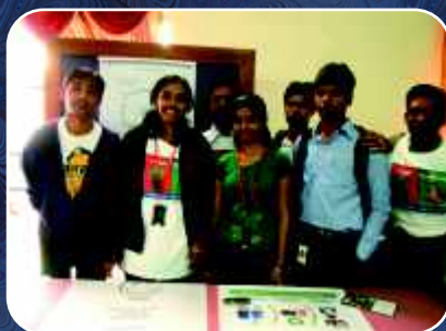
Students and faculty at the "Hara Kumbh Mela" to promote the green ideas of ABS