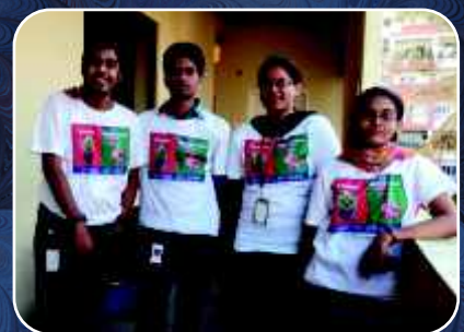
Team 'Kachara Daan' at Royal Sundaram office