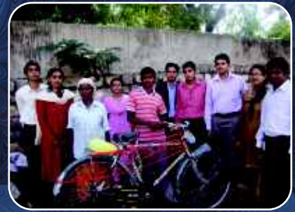
Students and Faculty of ABS with the rag picker-proud owner of the cycle donated by Yousee