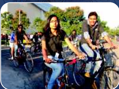
ASB students participate in the Republic day 2011 cycle ride