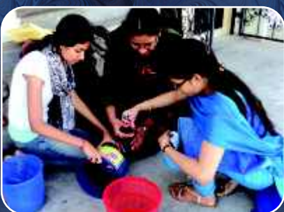
Students sticking the labels of dry waste on the bins at Royal Sundaram