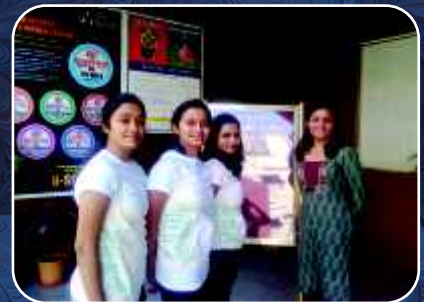
Students in their self designed T-shirts promoting Cloth & Jute bags