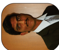
Gopinadh D DM-09-031