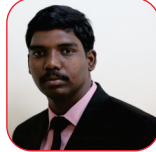
G V N M Swamy DM-09-027