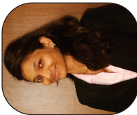
Sallaja B DM-09-021