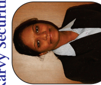
Prathiba V DM-09-004