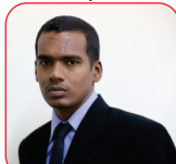
Pulla Reddy HM-01-003