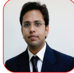
Teli Devesh DM-09-040