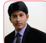
Sai Suprabhat DM-09-058