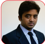
Amarnath N DM-09-001