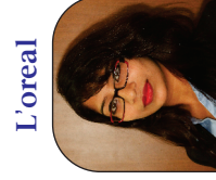
YSS Chandrika DM-09-025