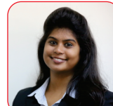
Navyatha U P DM-09-049