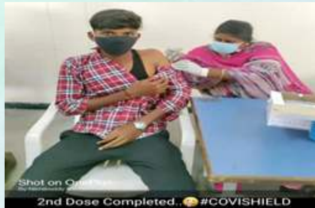
Covid-19 Drive- Covishield 1 & 2 doses administered to students at NAASAR School – on 05.10.2021