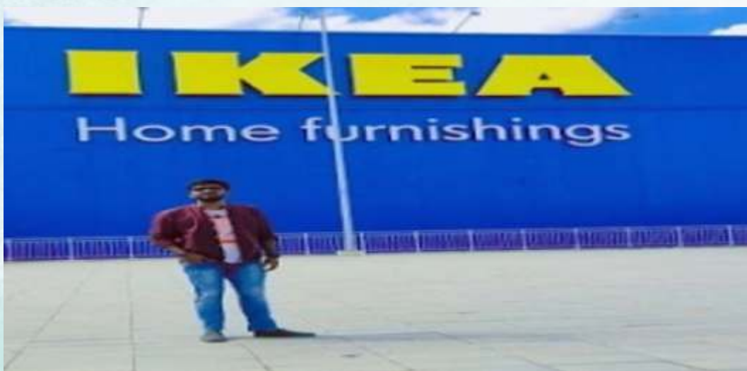
Industrial Visit to IKEA held on 25.09.2021