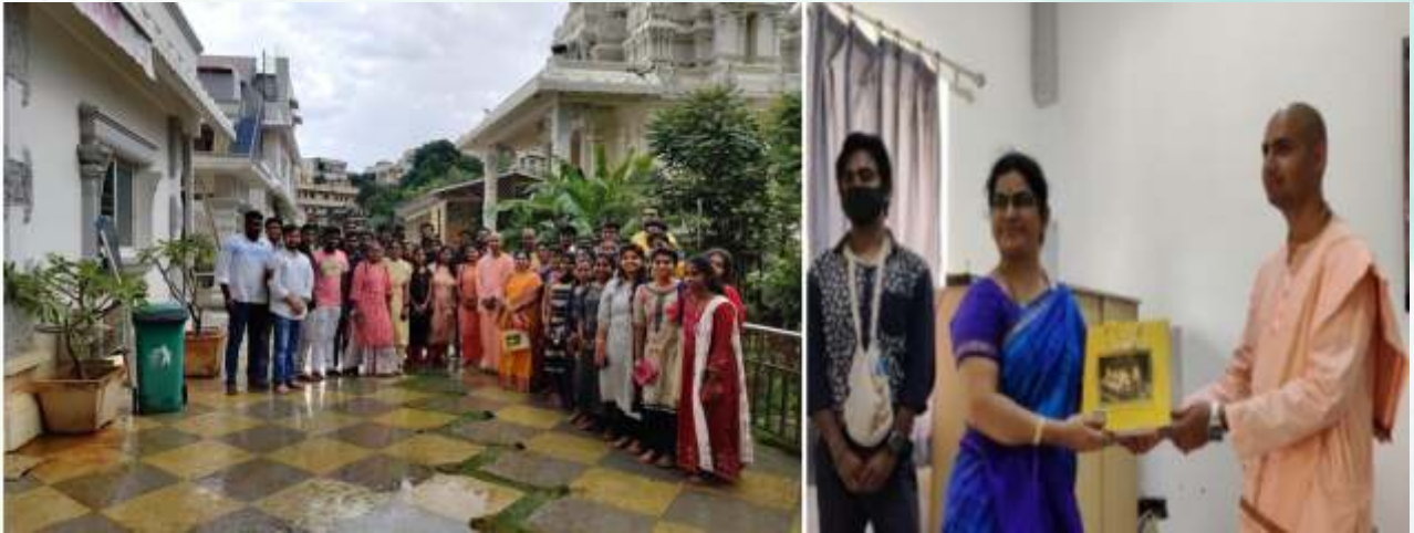
Students and faculty visit to ISCON Temple on 04-09-2021