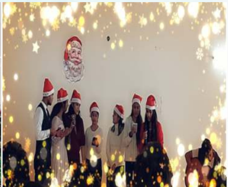
Christmas Celebrations @ ABS held on 24.12.2021