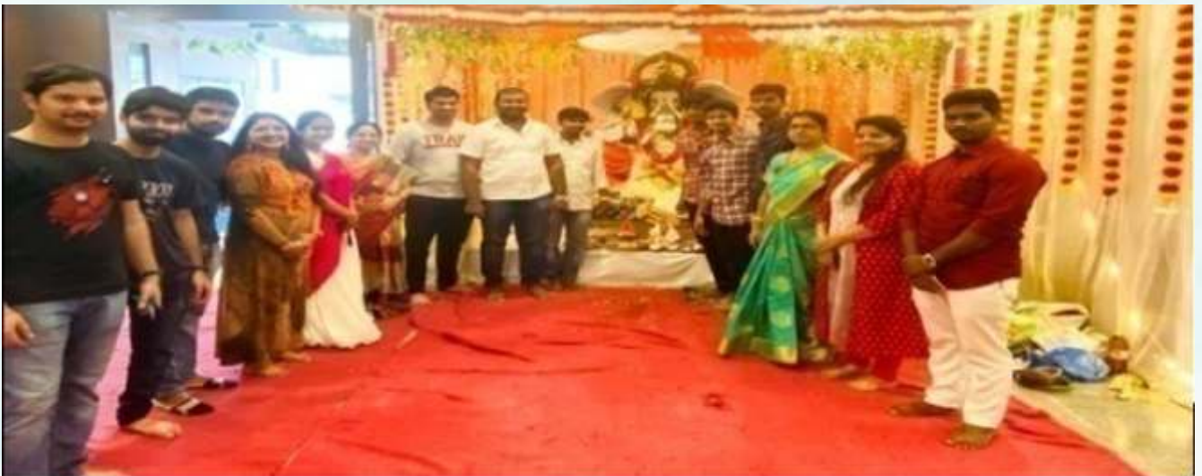
Ganesh Chaturthi Celebration @ ABS held on campus on 10-09-2021