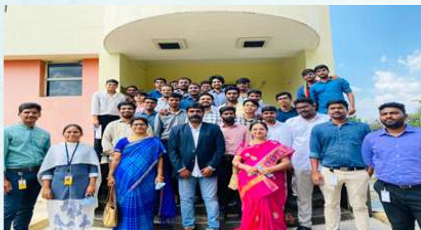
Industrial Visit to KJS conducted on 09.10.2021