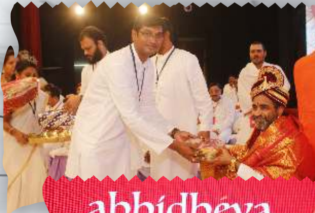
Photo Shots of Placement Day Celebrations Entitled Abhideya Held on 21 st October, 2017