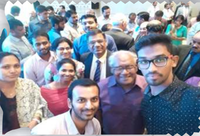
Students of Aurora's Business School with Bharat Ratna Dr. C.N.R Rao (8th September, 2017)